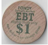
smaller wooden token